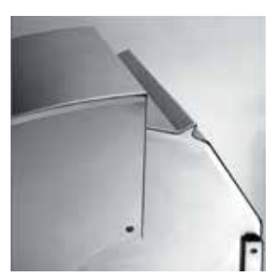
HEAT STABILIZING DESIGN