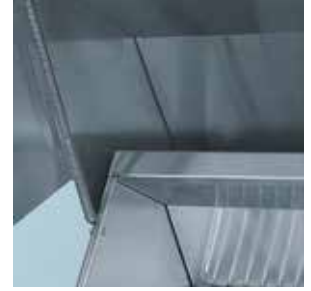
LYNX HOOD ASSIST