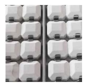
CERAMIC RADIANT BRIQUETTES