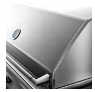
SEAMLESS WELDED CONSTRUCTION