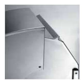
HEAT STABILIZING DESIGN