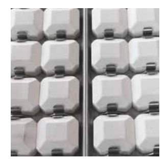
CERAMIC RADIANT BRIQUETTES