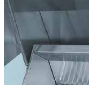
LYNX HOOD ASSIST

FOR MORE INFORMATION ON LYNX PROFESSIONAL PRODUCT FEATURES, PLEASE VISIT LYNXGRILLS.COM