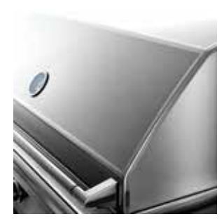
SEAMLESS WELDED CONSTRUCTION