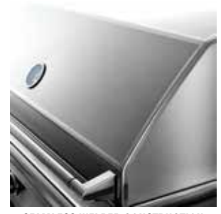
SEAMLESS WELDED CONSTRUCTION