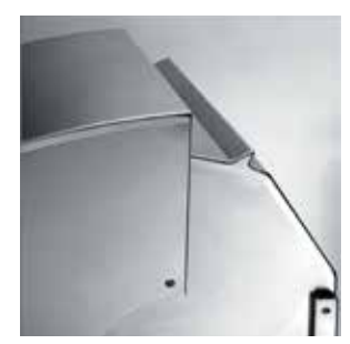
HEAT STABILIZING DESIGN