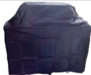
Grill Cover for Cart