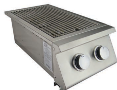
Premier Double Side Burner Model: RJCSSB Cutout: 10 3/4" W x 21" D x 8" H Overall: 12 7/8" W x 25" D x 9 3/4" H Two 12,000 BTU Burners with Removable Lid