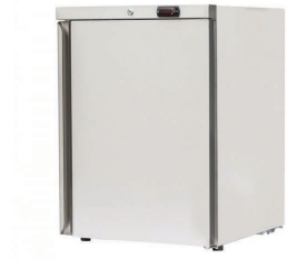
UL Rated Refrigerator

Reversible Hinge, 4.6 Cu. Ft., Door Lock, Interior Light, Adjustable Thermostat & Shelves, Glass Interior, Drawers, Automatic Defrost