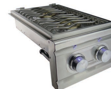
Cutlass Pro Double Side Burner Model: RDB1EL Cutout: 12" W x 19" D x 8" H Overall: 13 7/8" W x 22" D x 10 3/4" H Two 12,000 BTU Burners with Removable Lid, *LED Lights *When installed with Cutlass Pro Series Grills