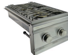
Double Side Burner Model: RDB1 Cutout: 12" W x 19" D x 8" H Overall: 13 7/8" W x 22" D x 10 3/4" H Two 12,000 BTU Burners with Removable Lid