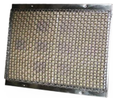
Grill Infrared Burner IR30