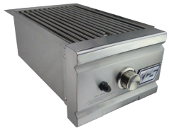
Infrared Side Burner