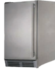
UL Rated Ice Maker

Reversible Hinge, 5.6 Cu. Ft., UL Certified for Outdoor use, LED Adjustable Thermostat