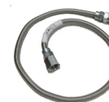
Stainless Gas Connection SSFLEX6436 OR 48