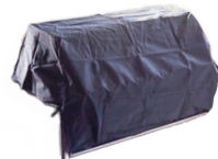
Grill Cover for Drop-In Grill