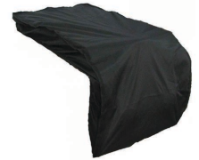
RCS Side Burner Cover