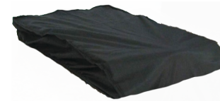
RCS Side Burner Cover