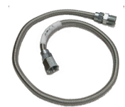
Stainless Gas Connection SSFLEX6436 OR 48