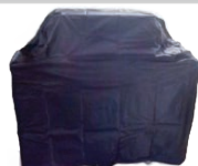
Grill Cover for Cart