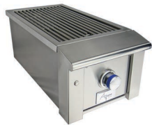
Agape Infrared Side Burner

One 22,000 BTU Burner with Removable Lid