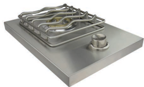
Single Side Burner Model: RSB1 Cutout: 8 1/2" W x 16 1/2" D Overall: 14" W x 19 1/2" D x 6" H One 12,000 BTU Burner with Removable Lid