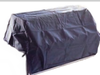
Grill Cover for Drop-In Grill